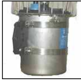
3400D & 4400D (3/4 & 1 HP) Band Placement