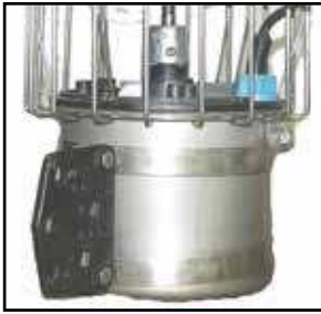
2400D (1/2 HP) Band Placement