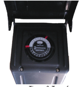
Timer & Transformer -for LED